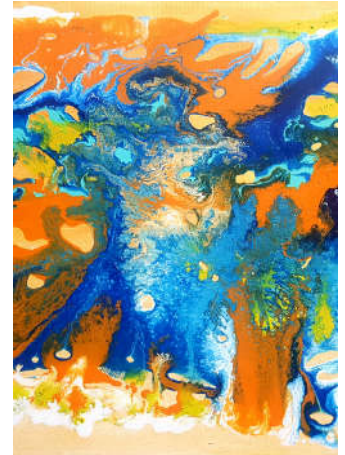
Acrylic Pour Painting by Peg Juneau