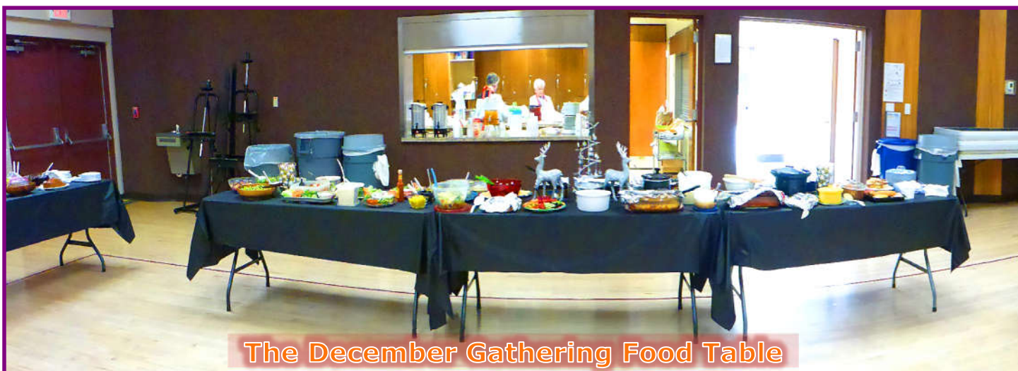
The December Gathering Food Table

January 18 9am - 12noon ABSTRACT WORKSHOP Kelly Abraham $20