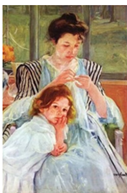
Mary Cassatt, Young Mother Sewing oil (1910)

Mary Cassatt (1844-1926) while working in almost the same time frame, is one of the only women Impressionist artists that were recognized at that time. Born in Pennsylvania to a successful stockbroker and land speculator, she lived much of her adult life in France, where she exhibited with the Impressionists and befriended Edgar Degas, who had considerable influence on her work. She became extremely proficient in the use of pastels, eventually creating many of her most important works in this medium. An active feminist, Cassatt often created images of the social and private lives of women, with particular emphasis on the intimate bonds between mothers and children. Perhaps of most importance because of her wealthy status, Cassatt served as an advisor to several major art collectors who purchased and donated to American art museums which helped bring the work of many Impressionists into the country. .