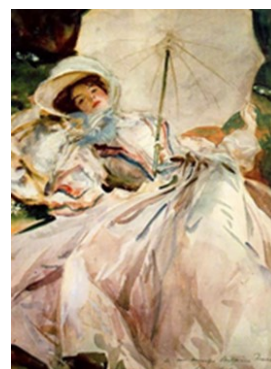
John Singer Sargent, Girl with Umbrella watercolor (1910)