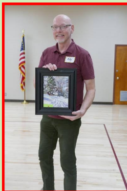
Holiday Theme Art Winners