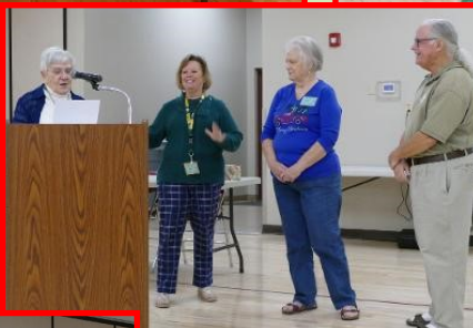
Installing 2024 Officers