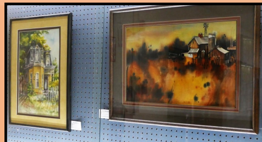
Artist of the Month Showcase