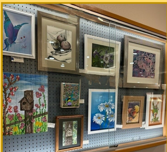
PVA Members ' Art

Artwork must be framed and ready for hanging. Smaller sizes, such as 8 x 10, 11 x 14 are preferred.